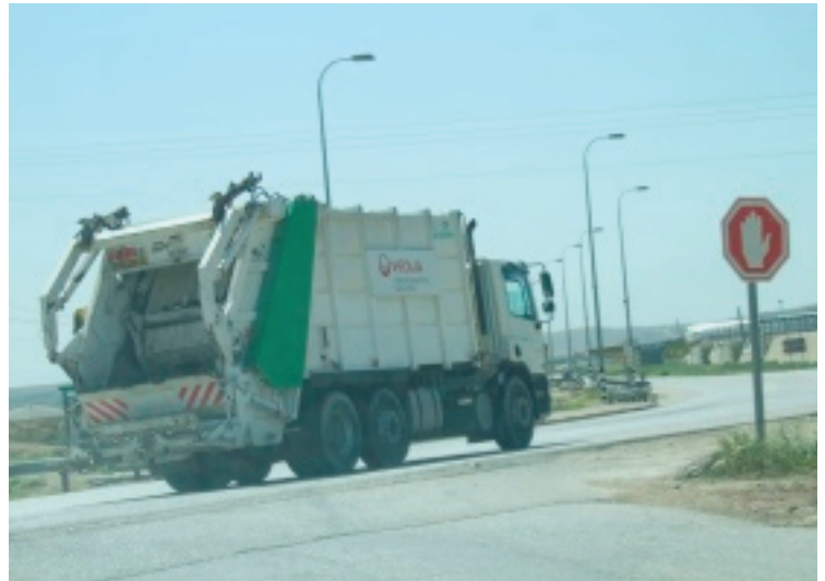
Above: Photographed in March, a Veolia truck picks up rubbish from Tomer settlement in the occupied Jordan Valley.

Sustained pressure on Veolia around the world is an important part of the BDS movement and a similar campaign in Auckland to pressure the new Supercity Council not to renew the contract with Veolia in 2014 would send a message to multinational corporations around the world that New Zealanders don't want services from a company that builds garbage dumps and train-lines for the Israeli settlements.